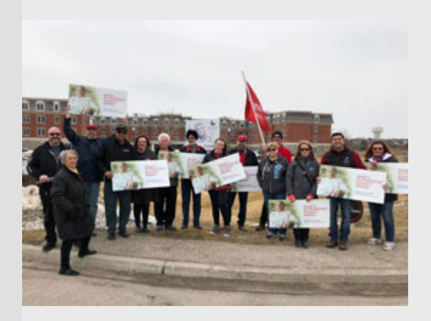
Unifor members organize actions during Chartwell Retirement's open house to demand fair wages.